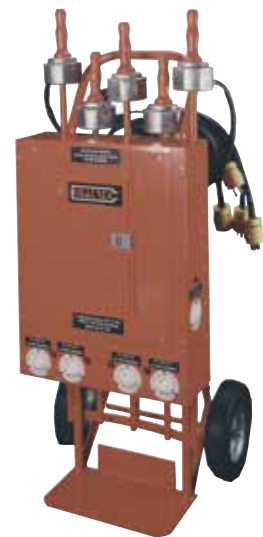
Portable Distribution Center